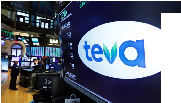
The logo for Teva appears above a trading post on the floor of the New York Stock Exchange, October 21, 2019.