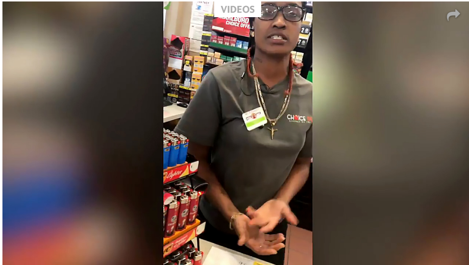
Clerk refuses to serve immigrants while demanding 'United States ID,' NC lawsuit says